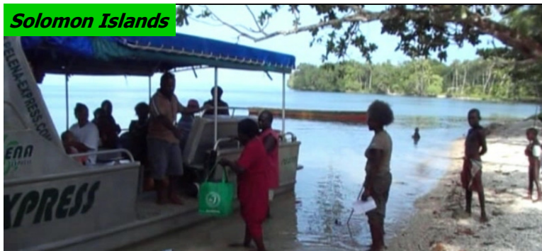
Accessible beachfront water transportation with Pelena's jet-boat.