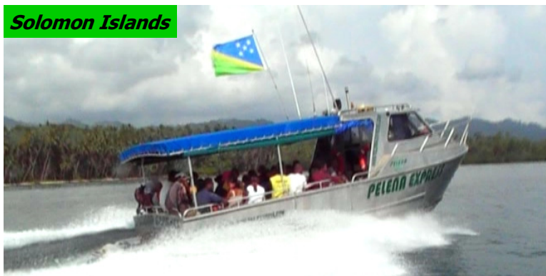
Fast water transportation with Pelena's jet-boat.