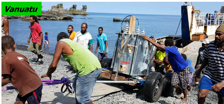
Pelena's multipurpose equipment trolley to manually haul heavy equipment to site.