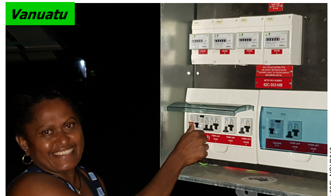
Village electrical reticulation training by Pelena's Solomon Islands staff.