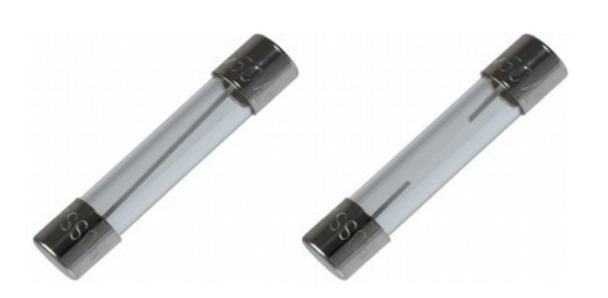
3AG type fuse used in control cabinets. Good (left), Blown (right). The wire in the 3AG fuses is visible through the glass casing and it is easy to tell if the fuse is blown.

Pelena Energy commonly uses two types of fuse, shown below.