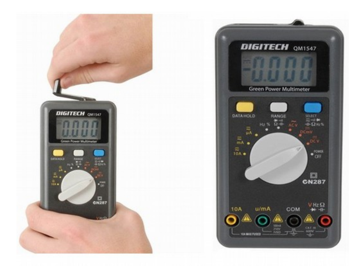
Pelena Part 503-006

Pelena supplies a multimeter (Pelena Part Number 503-006) that has both modes. The following instructions are written for this multimeter.