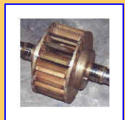
Pelena Crossflow Turbine

Offices in Solomon Islands, Australia & online support at pelena.com.au